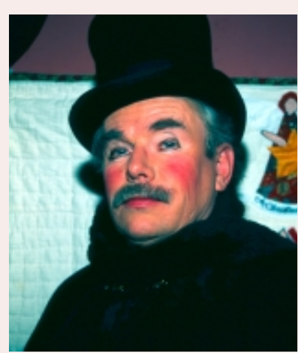
Charles Dickens would be proud.