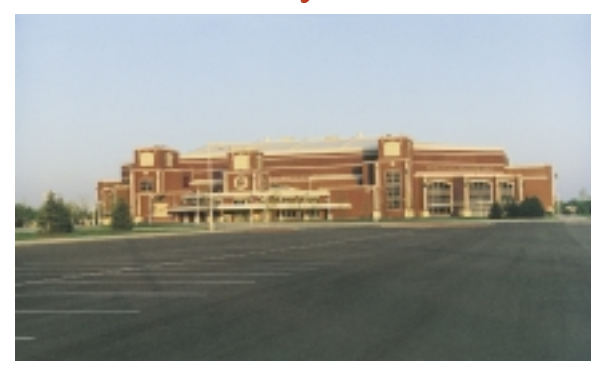
The World Junior Hockey Championships will be held in Grand Forks' Ralph Engelstad Arena beginning in late December.

The top junior hockey teams in the world are headed to Grand Forks for the World Junior Hockey Championships. Games at Ralph Engelstad Arena get under way Dec. 25, with the gold medal game slated for Jan. 4, 2005.