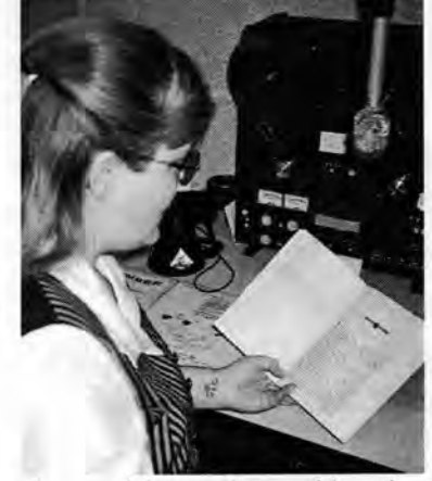
T.C. reads a wide variety of books for our locally produced collection of talking books.