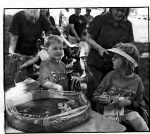
Summer readers and their families enjoying the carnival at the State Library

Participants of the Governor's Summer Reading Program celebrated their efforts with a party at the North Dakota State Library this past August.