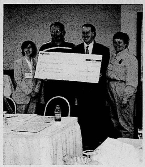
Highsmith Inc. presents members of the CSLP with a $22,000 rebate check.

There are currently eleven states besides North Dakota that take part in the Cooperative Summer Library Program.