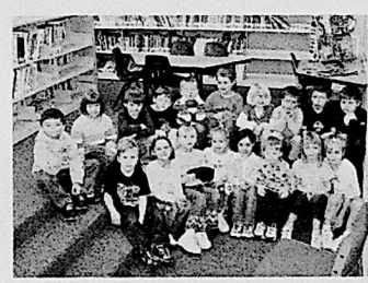
Kindergartners enjoying the new "library pit" while listening to some great stories

The library now boasts over 20,000 volumes which are all catalogued on the Spectrum computer program for easy patron access.