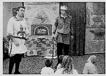
The Traveling Lantern Theatre Company from San Diego, California, performed at the Mandan Public Library

Kiwanis Club, Knitting Club, Aquarium Club, and Girl Scouts make use of the many meeting rooms the library has to offer.