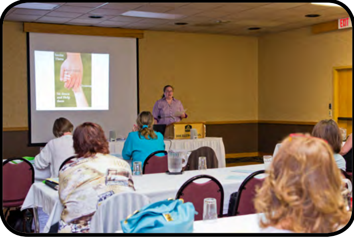
North Dakota State Library staff presented twelve workshops during the three-day Summer Breeze Colloquium in Bismarck.

explored website presence, weeding, library policies, long-range planning, data analysis, basic bookkeeping, statistical reporting, social media, genealogy, supporting foundations, and information literacy. The Colloquium equipped librarians and library board members with the knowledge and skills necessary to improve their library's value and benefit within the community.