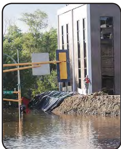
A National Guard soldier patrols the dike surrounding the Minot Public Library.

Make plans to attend this wonderful opportunity for education, networking, and fun! For more information or to submit your registration, please visit the conference website at http://www.ndla.info/Conference/11conf.htm .