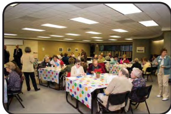
About 50 volunteers and guests attended the volunteer recognition event.