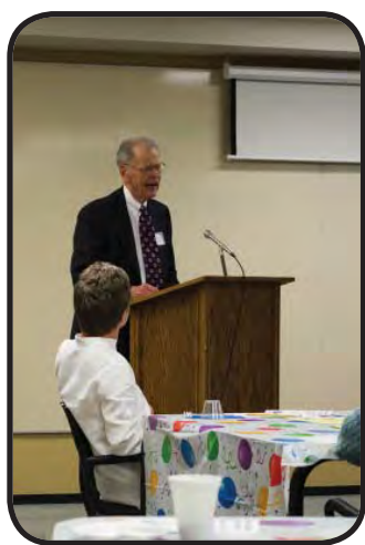
North Dakota Supreme Court Chief Justice, Gerald VandeWalle

Volunteers contributed 3,912 hours to the North Dakota State Library during the period of April 1, 2010 to March 31, 2011. The majority of those hours were within the Talking Books department of NDSL, which offers reading services for individuals with physical, visual, or reading impairments.