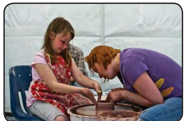
The Bismarck State College Art Department provided hands-on pottery lessons for children.