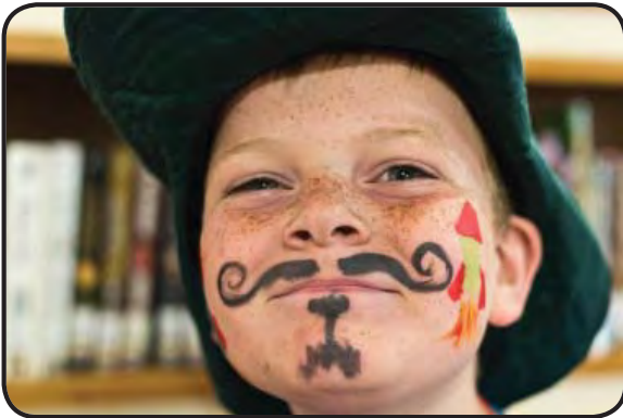
Face painting was a popular activity during the 2011 Bismarck/Mandan Summer Reading Kickoff.

Capitol City Cloggers, United Tribes Technical College Dancers, International Club, French Club, and Northern Plains Dancers.