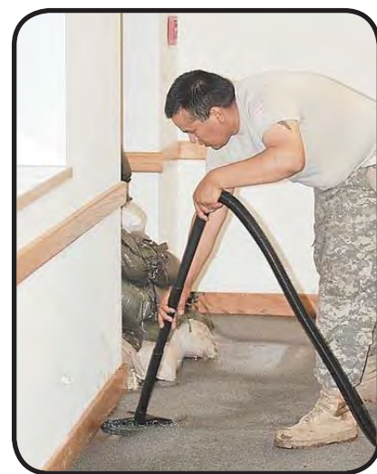
A National Guard soldier works to keep water out of the Minot Public Library basement.