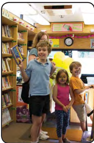
The Burleigh County Bookmobile and the Morton Mandan Bookmobile were present to showcase their services and encourage summer reading.