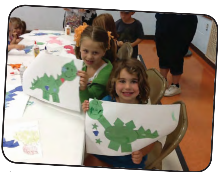
Children in the Underwood community learned about "Dreaming Big" during the time of the dinosaurs. They made dinosaur crafts from various shapes during craft hour.