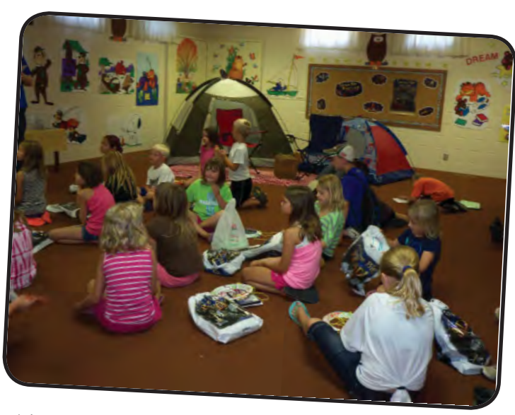
The Heart of America Library in Rugby had over 150 participants during the 6-week summer reading program. Children were able to make fireflies, dreamcatchers, and planets and constellations as part of the program. Local businesses donated prizes for the young readers.