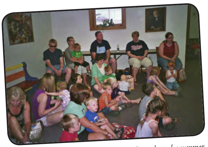
The Valley City Barnes County Public Library hosted a summer reading program for all ages. The children's "Fun Day" featured a sand box search for prizes, a fish pond, live music, star cookies, and a water balloon toss. During the summer, storytime was held every Wednesday at the library.