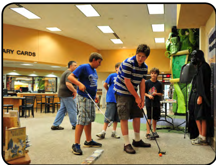
Bismarck Public Library hosted a very successful Friday the 13th “Mini Golf @ Your Library.” Fifty teens attended the event, which was sponsored by Verizon, Central Market, Walmart, and Bismarck Parks and Recreation.