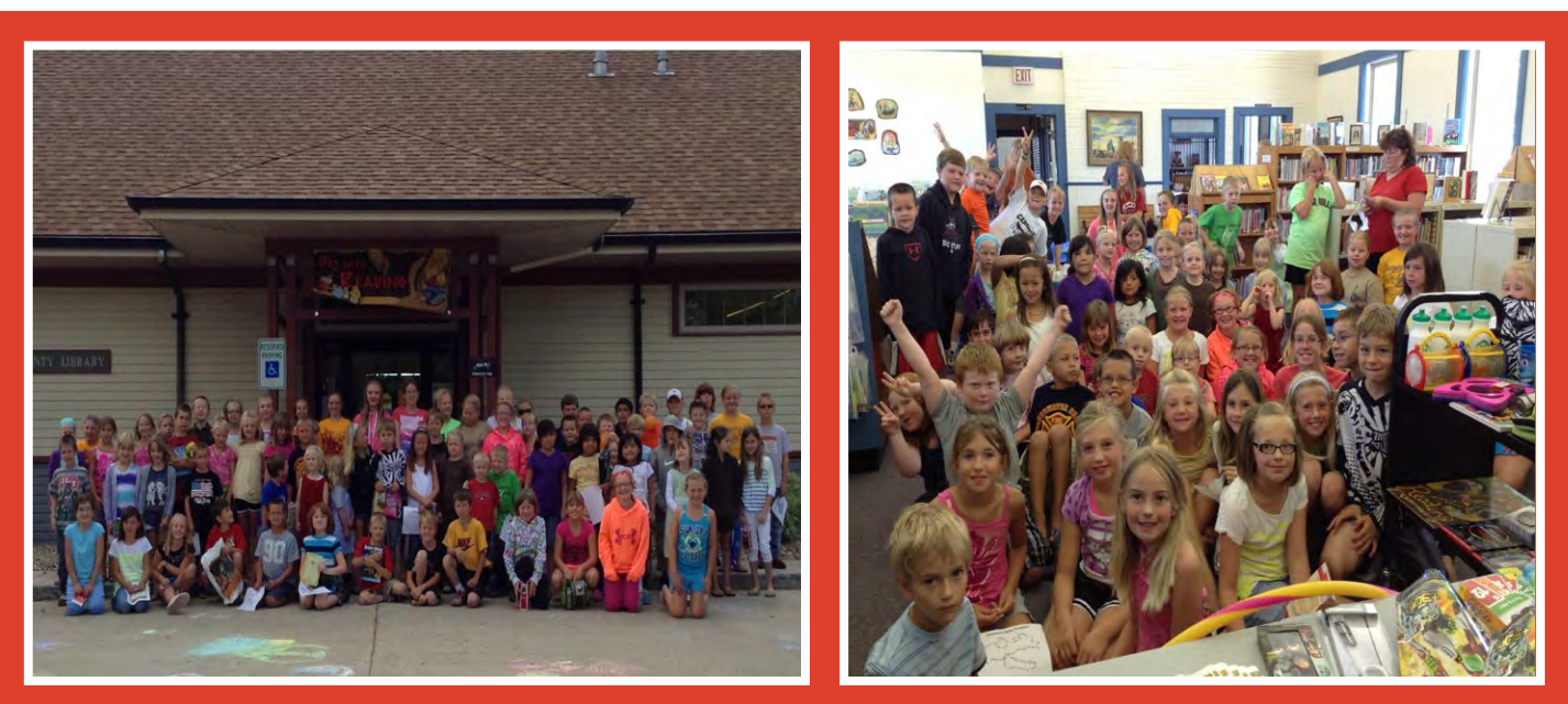
A look back at summer reading at Cavalier County Library!

The West Fargo Historical Center (located on the upper level of the West Fargo Public Library) is presenting an exhibit based on the theme for West Fest — Remember the Past, Envision the Future. The exhibit features an illustrated timeline of the history of West Fargo and includes a few peeks at what lies ahead. The exhibit will be on display during the month of September. Photos of the exhibit can be found on the Library's Flickr page (http://www.flickr.com/photos/westfargopubliclibrary/). This exhibit is being featured on the West Fest website (http://www.westfargond.gov/westfest/Schedule/tabid/494/language/en-US/Default.aspx). West Fest is a community event that includes a parade, homecoming, Firefighter's ball, pancake breakfast, and a rummage sale.