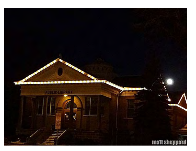
ND State Library