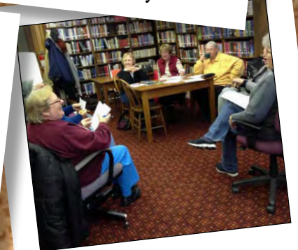
Book Club at Hankinson Public Library