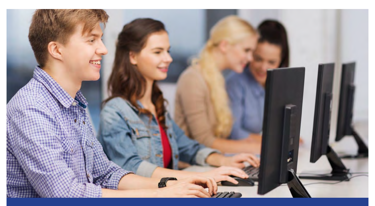
2014 Summer Class for 1 graduate credit: