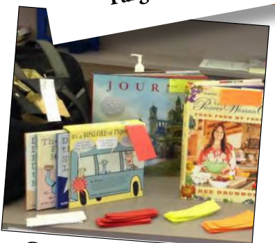
Cavalier County Library Celebrated National Library Week