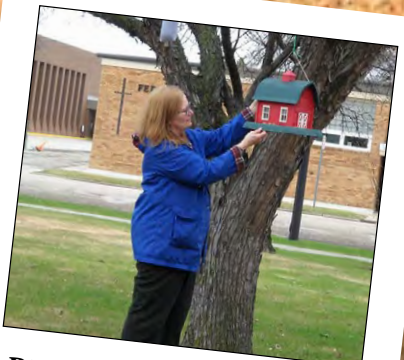
Bird Watching at Carnegie Regional Library