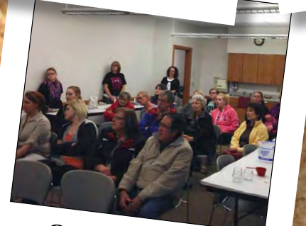
Go Green Night at Minot Public Library