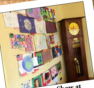
Youth Art Show at Bowman Regional Public Library