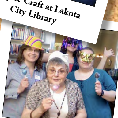
Photobooth fun at Leach Public Library