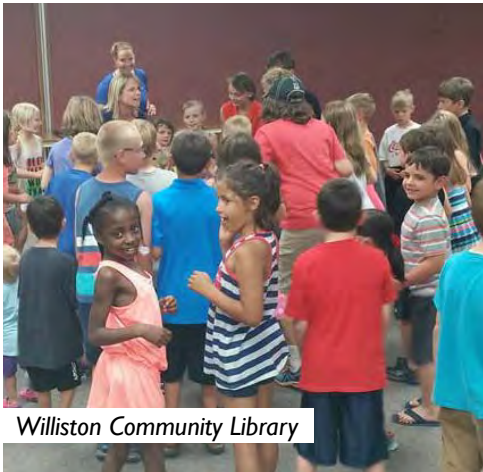
Williston Community Library