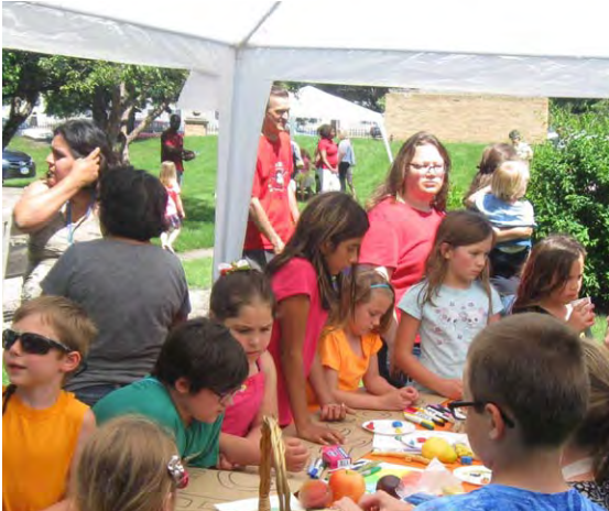
Grand Forks Public Library