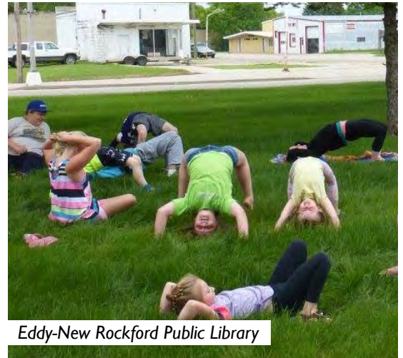
Eddy-New Rockford Public Library