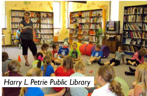
Harry L. Petrie Public Library