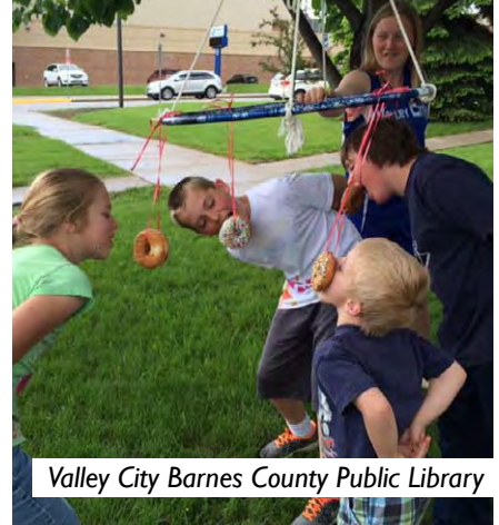
Valley City Barnes County Public Library