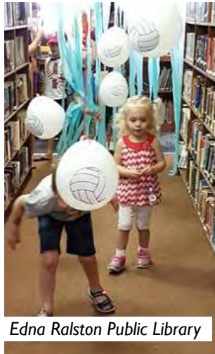
Edna Ralston Public Library