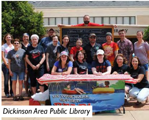
Dickinson Area Public Library