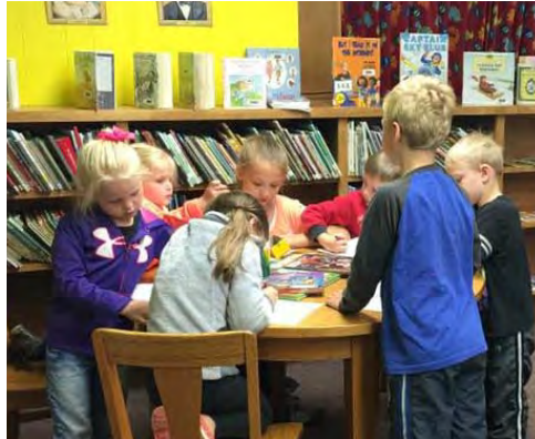
Carnegie Regional Library