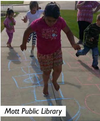
Mott Public Library