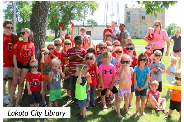
Lakota City Library