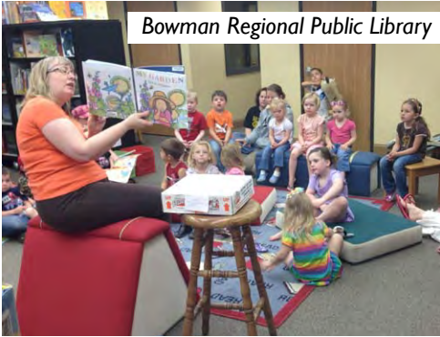
Bowman Regional Public Library