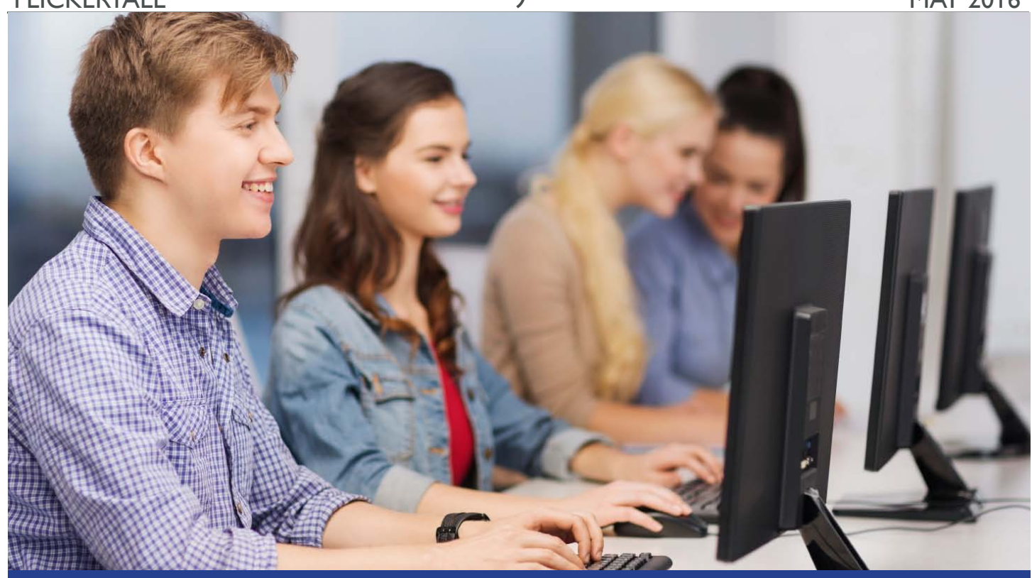
2016 Summer Class for 1 graduate credit: