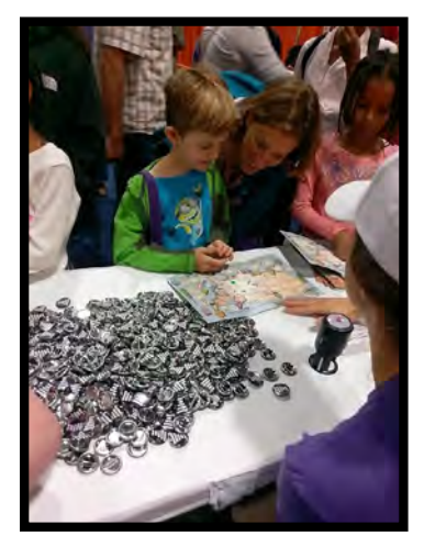
Finding North Dakota on the reading map was a cinch for most of the festivalgoers.

The event is an incredible experience and a clear expression of the love of literacy and literature that the Library of Congress, and every librarian and book-lover in every state, promote all throughout the year.