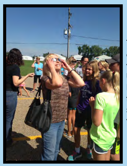
The community went to the Underwood Public Library for their solar eclipse viewing party