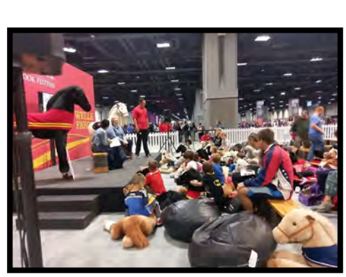
Storytime is always more fun when you get to ride a pony!