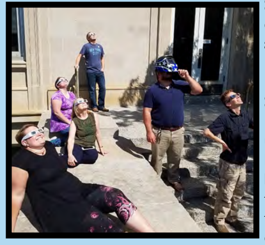
Some of the employees at the North Dakota State Library used their lunch breaks to view the solar eclipse.