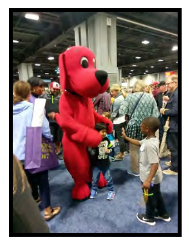
Kids were able to take pictures with Clifford, Captain Underpants, Maisy Mouse and Waldo.