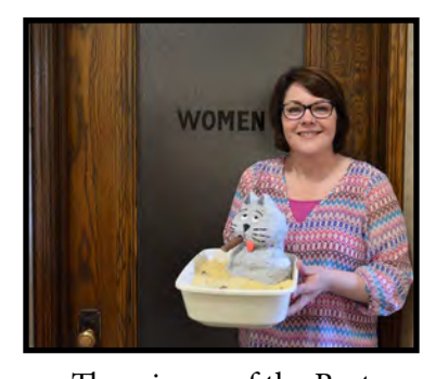
The winner of the Best Representation of Book and People's Choice: "Great Grandpa's in the Litter Box"