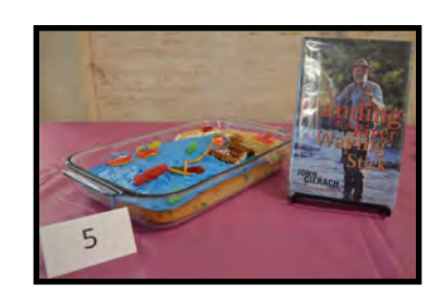
"Standing in a River Waving a Stick"