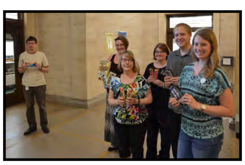
The winners of Most Creative: "Lonesome Dove"