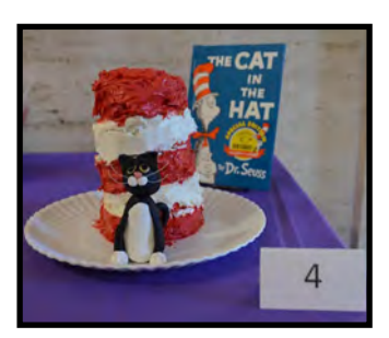
"The Cat in the Hat"