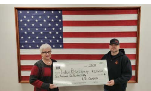
Lisbon Fire Department Inc, LFD's gaming organization, is proud to support the Fire Department and projects within the community. LFD Inc recently donated $2,250 to the Lisbon Public Library to

Learn more about this opportunity from their press release and fill out the survey to be considered as a kit recipient.