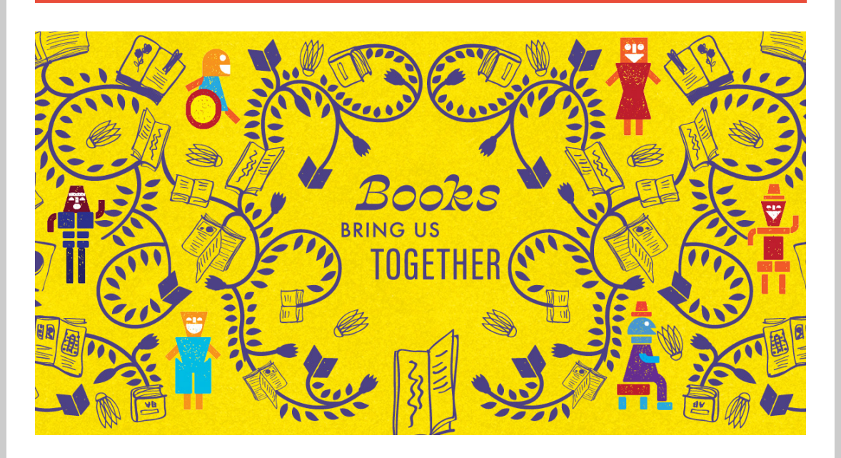
2022 National Book Festival

WebJunction builds the knowledge, skills, and confidence of library staff to power strong libraries that are the heart of vibrant communities. As a program of OCLC Research, WebJunction is free and welcome to all libraries to use, regardless of size, type, or location. For more information about WebJunction, visit <a href="https://www.webjunction.org">www.webjunction.org</a>.