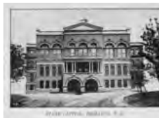
North Dakota State Capitol, Bismarck, N.D., circa 1915