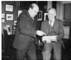
Sen. Frazier and Rep. Lemke review documents, 1936