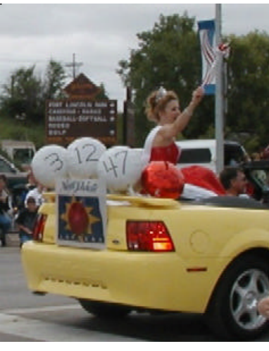
or a look-a-like?

Cenex in Fessenden prepared a float in their town's parade on June 19th featuring their "Lady Luck" handing out good luck chocolate kisses.