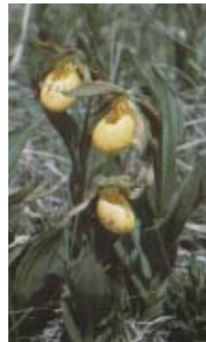
Small Lady's Slipper Orchid

Athyrium filix-femina Botrychium minganense Campanula aparinooides Carex lasiocarpa Carex leptalea Cypripedium parviflorum Cypripedium reginae Dryopteris carthusiana Dryopteris cristata Eriophorum viridicarinatum Galium labradoricum Menyanthes trifoliata Onoclea sensibilis Salix pedicellaris Thelypteris palustris