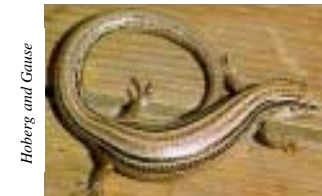
Northern Prairie Skink

H.R. Morgan (North) spans over a mile of Sheyenne River and extends from the Sheyenne sandhill uplands down to the floodplain forest lowlands. The dry choppy dune habitat is a striking contrast to the sheltered forest and extensive site wetlands. Mirror Pool, its original name, comes from the mirror-like quality of the central oxbow pool which, before a dam went out, was a favorite fishing hole.