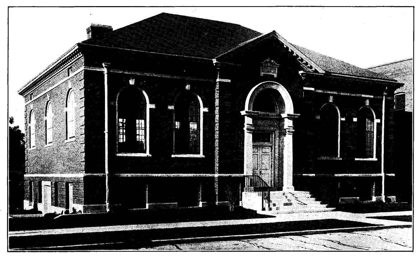
Carnegie Library, Bismarck.