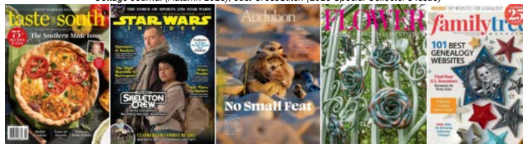
Taste of the South (July/August 2025); Star Wars Insider (Issue 232); Audubon (Summer 2025); Flower (July/August 2025); Family Tree Magazine (July/August 2025)