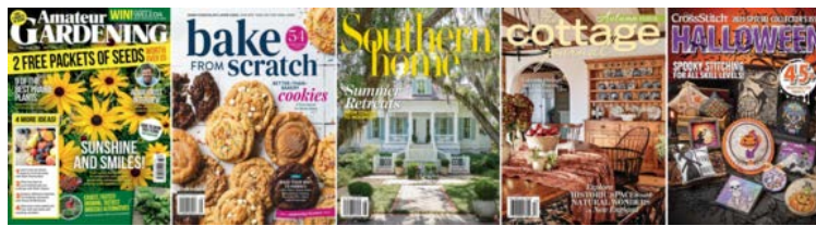
Amateur Gardening (28th June, 2025); Bake from Scratch (July/Aug 2025); Southern Home (July/August 2025); The Cottage Journal (Autumn 2025); Just CrossStitch (2025 Special Collector's Issue)