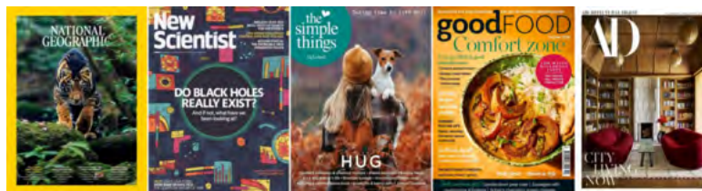
National Geographic; New Scientist; The Simple Things; Good Food; Architectural Digest