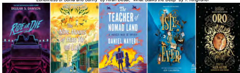
"Ride or Die" by Delilah S. Dawson; "The Nine Moons of Han Yu and Luli" by Karina Yan Glaser; "The Teacher of Nomad Land" by Daniel Nayeri; "Isle of Ever" by Jen Calonita; "Oro" by Alex Aster