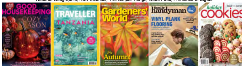
Good Housekeeping; National Geographic Traveller (UK); Gardeners' World; Family Handyman; Holiday Cookies