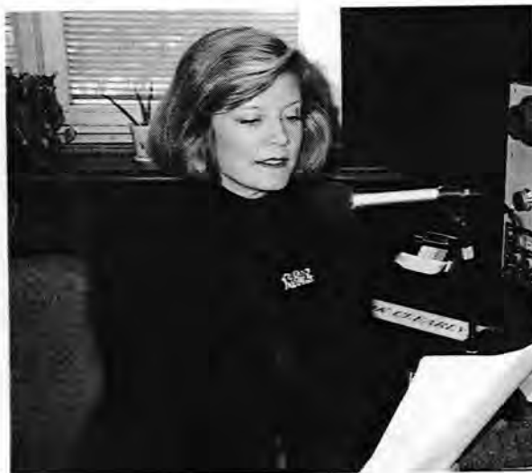
North Dakota's First Lady reads a Christmas story as a gift to our patrons.