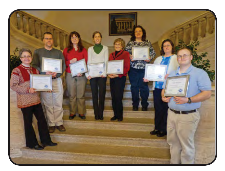
North Dakota State Library staff were recently recognized for their years of service to the North Dakota State Library and the citizens of North Dakota. Years of service for these awards ranged from three years to ten years.