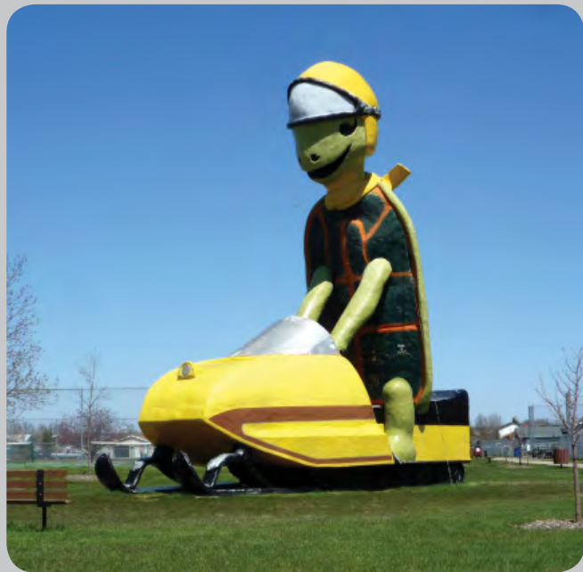
Don't let the photo fool you - Tommy usually has plenty of snow for riding!

Tommy was supposedly built to recognize the nearby Turtle Mountains. Interestingly, Tommy the Turtle is only one of three giant turtles in the region. Nearby Dunseith, North Dakota, is home to the Wheel Turtle (featured in the October 2012 Flickertale ). In addition, Boissevain, Manitoba, a small city just a few minutes north of the Canadian border, hosts a 28 foot turtle (without snowmobile), also named Tommy.