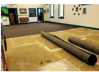
Cavalier County Library is getting new carpets! See the remodel pictures at: http://on.fb.me/IFOoWII