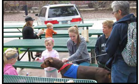
"READ" therapy pets who read with the kids for the Reading Tails Program.