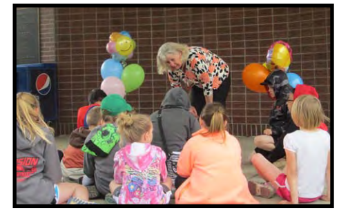
First Lady Betsy Dalrymple helped kick off of the program by reading to the kids and giving away books provided by United Way.