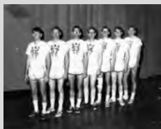
University of North Dakota men's cross country team, 1967

A highlight of the items added to the various digital collections of the North Dakota State Library.