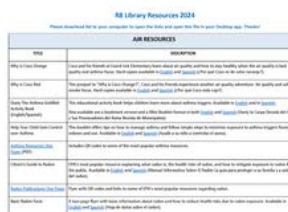
Figure 1: Community Library Program Overview