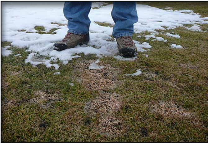
Pink snow mold.