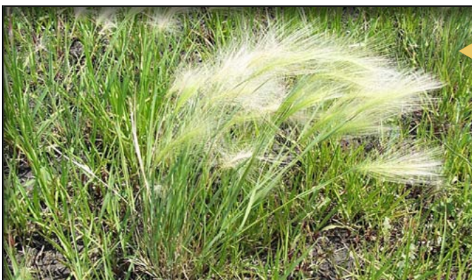
Foxtail barley.

Another desirable grass on golf courses, it can be an annoying weed in the home lawn. The seed being very small (more than 5 million seeds/pound), it easily can become wind-borne or carried on golfing equipment to the home lawn environment. It becomes obvious in a typical higher-mowed bluegrass turf by spreading in circular patches with its stoloniferous growth over the top of the desired grass. Like tall fescue, if just a few clumps occur in the home lawn, the homeowner is better off simply digging out the offending patches and either sodding or seeding the open area immediately.