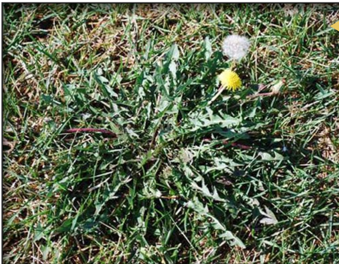
Dandelion.