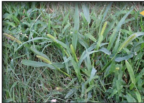
Foxtail.