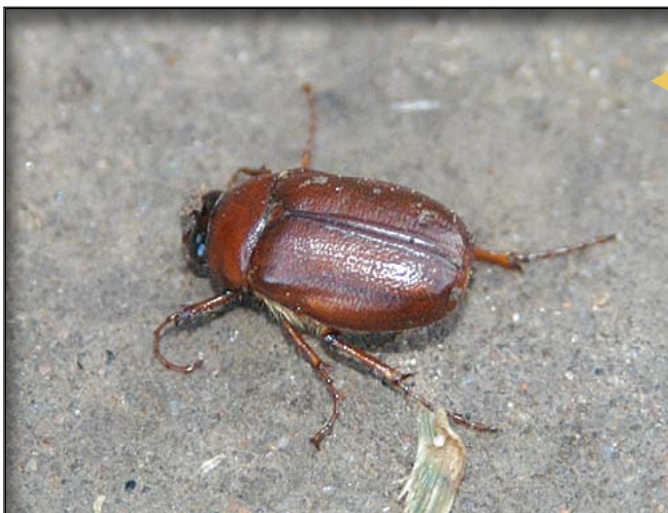
May/June beetle adult.

Sampling method: Soil pest sampling for larvae of May and June beetles and masked chafer beetle, and irritant sampling for billbug adults