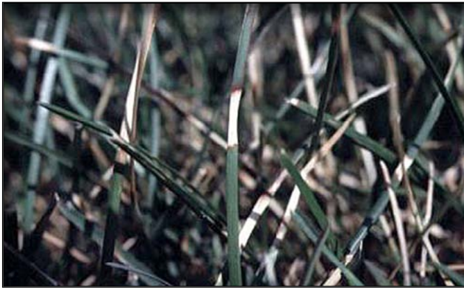
Dollar spot leaf lesions.