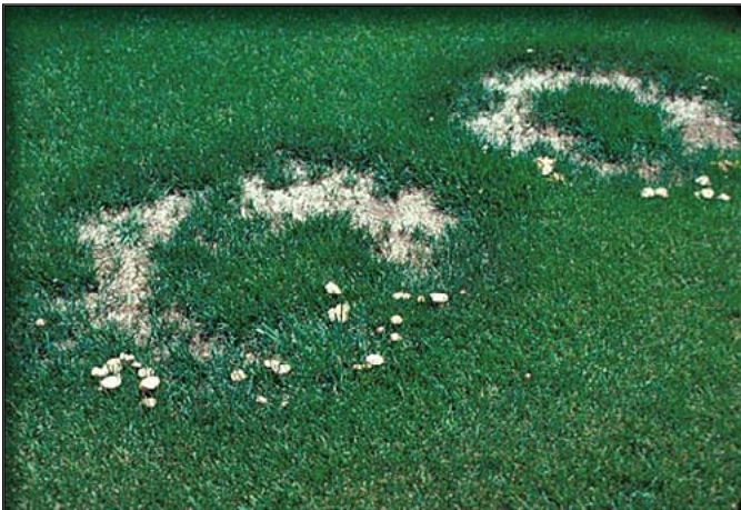
Fairy ring.

rings have a band of dead grass and a band(s) of dark green grass. Type II fairy rings lack the band of dead grass, and Type III fairy rings consist of a ring of toadstools or puffballs that may be accompanied by a dark green ring. The lush green growth, called the zone of stimulation, is caused by the release of nutrients (primarily nitrogen) from the activity of the fungus decomposing organic matter in the soil, such as dead tree roots, buried construction material or excessive thatch. The ring of dead or dormant turfgrass plants, the zone of inhibition, is a result of the water-resistant (hydrophobic) properties of the fungal mycelia. As the fungus grows in the thatch and soil, it prevents water from penetrating and reaching the plant roots. The result is plant dormancy or death. The majority of the fungal mycelia can be found below the fairy ring symptoms. As you move toward the center of the ring, the fungus is absent, resulting in a return to the normal appearance of the turfgrass plants and the characteristic ring symptom of this disease. The bands of lush growth often are visible throughout the growing season and may persist in the same location for many years as long as a food source remains. Fairy ring damage is the most severe in dry, nutrient-poor areas and can be exacerbated by excess thatch.