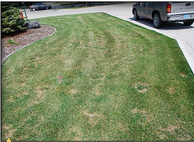
Summer patch.