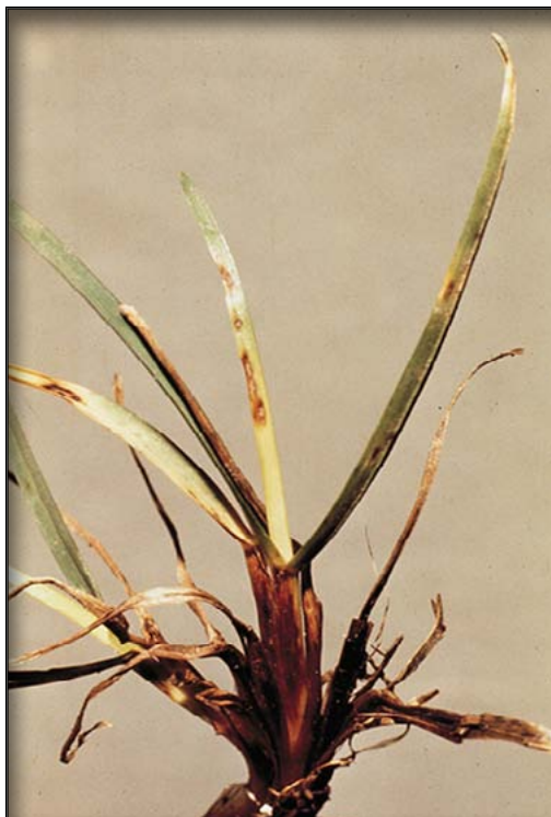
Melting out phase.

Cultural methods to prevent leaf spot and melting out: Avoid high nitrogen fertility, avoid low mowing heights, mow with sharp blades, water deeply and infrequently to prevent drought stress, avoid prolonged