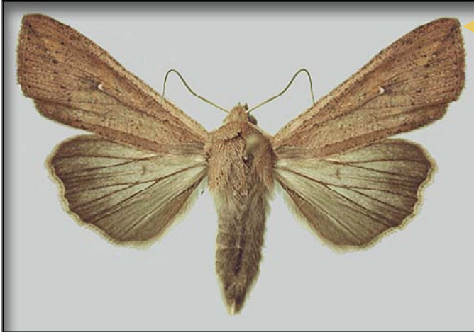
Armyworm adult.