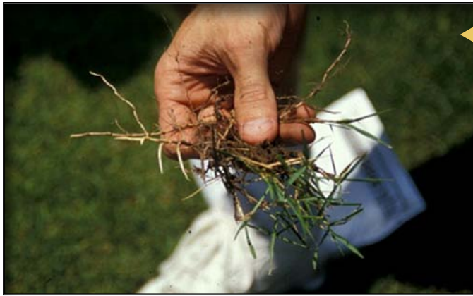
Quackgrass with rhizomes.