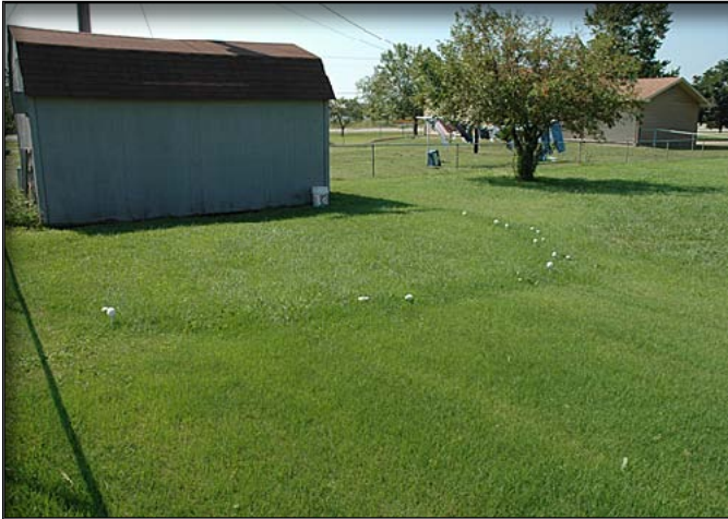
Fairy ring.