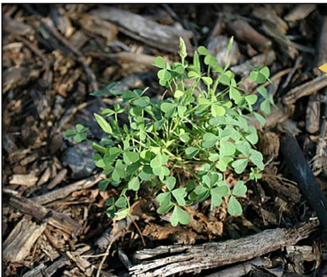
Oxalis.

This, along with white clover , Trifolium repens L., is a member of the legume family, giving both the ability to mine nitrogen from the air as well as the soil. Black medic produces foliage similar to that of white clover, being trifoliate in form. Black medic distinguishes itself with vivid yellow flowers and hairy stems leading up to the leaves. While the flowers of white clover are attractive to bees, those of the black medic are much less so. Black medic is a winter or summer annual that disperses seed every year, with a strong taproot, making it difficult to remove by hand pulling. While white clover is a perennial and will root along spreading stems, black medic does not root at the nodes. Both are tolerant to 2,4-D so herbicide mixtures should be used.