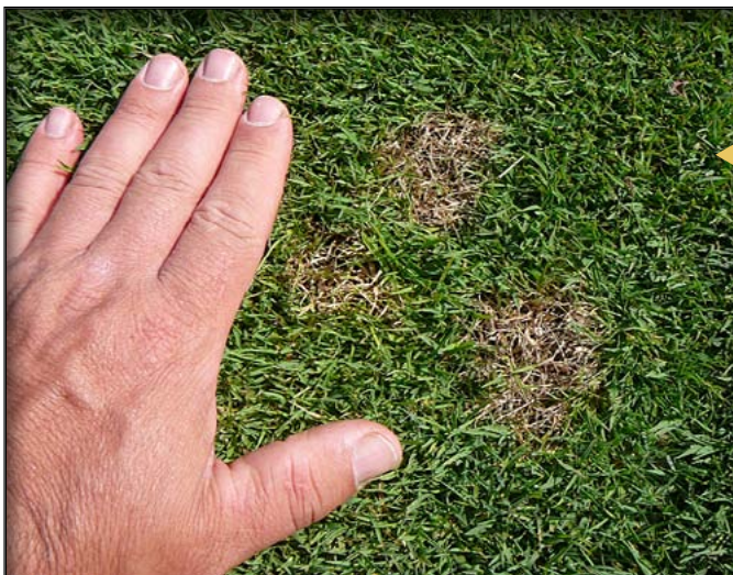
Dollar spot.