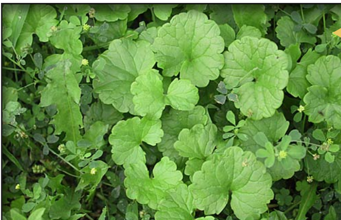
Ground ivy.

The slender stems on this aggressive, deep-rooted perennial make it difficult to control in both lawns and surrounding ornamental plants. Spade-shaped leaves have pointed basal lobes. Field bindweed is immediately recognizable when the white to light pink morning glory-type flower is produced. The extensive root system and numerous viable seeds that are produced make this species difficult to control, especially in high-traffic or compacted areas.