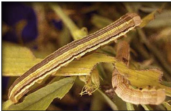
Armyworm larvae.