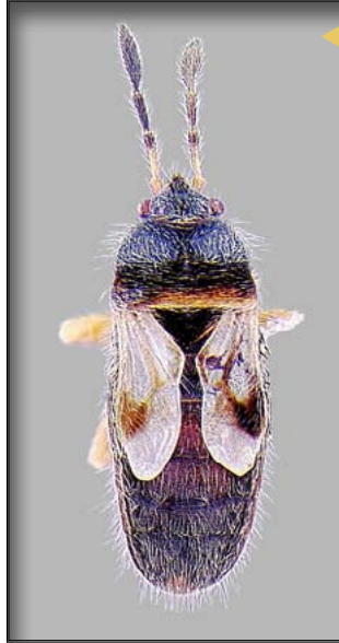
Western chinch bug nymph.