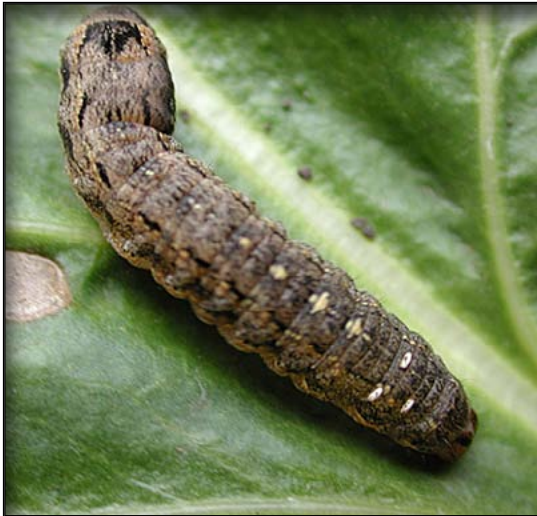
Variegated cutworm larva. (Gerald Fauske, NDSU)

turfgrass. Once the warm weather of spring arrives, adults begin feeding on flower nectar. Females then attach eggs to the tips of grass blades. As morning light appears, larvae burrow into the soil or hide under foliage to avoid detection throughout the day. Damage is more noticeable in short grass compared with grass mowed high. Defoliated areas may range in size from that of your little finger to large patches several feet wide. Cutworm larvae may kill turfgrass if they feed low enough to injure or destroy the crowns. If insecticidal control is necessary, the optimal application time is late evening because larvae actively feed after dark.