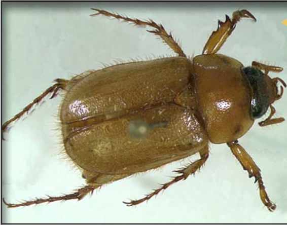
Masked chafer adult.