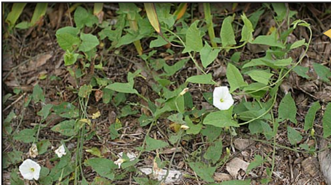
Field bindweed.

A cool-season perennial, this plant will make itself known via the heart-shaped leaves that have a waxy surface and reproduce via bulbs and seeds. The lavender violet flowers look nice in a flower bed, but when spreading in a lawn, this plant is a source of annoying distraction. Few herbicides effectively control wild violet; consequently, proper timing of the herbicide application is very important to maximizing control.