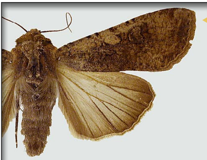
Variegated cutworm adult. (Gerald Fauske, NDSU)

Threshold number: five larvae per square yard