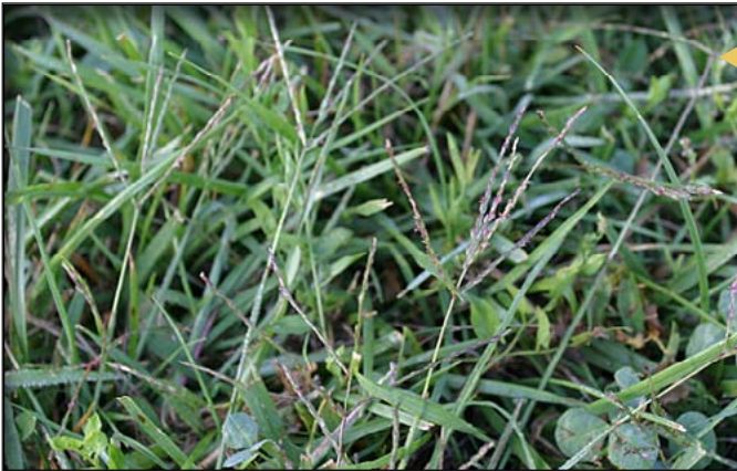
Crabgrass with distinctive seed heads.