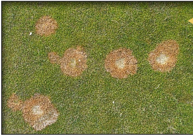
Pink snow mold.