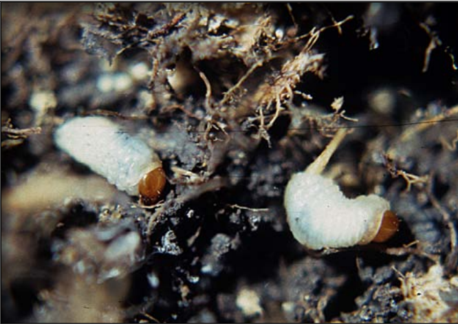
Billbug larvae.