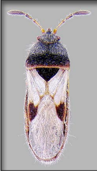
Western chinch bug adult. (Patrick Beauzay, NDSU Department of Entomology)