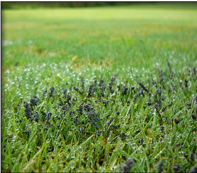
Slime mold.