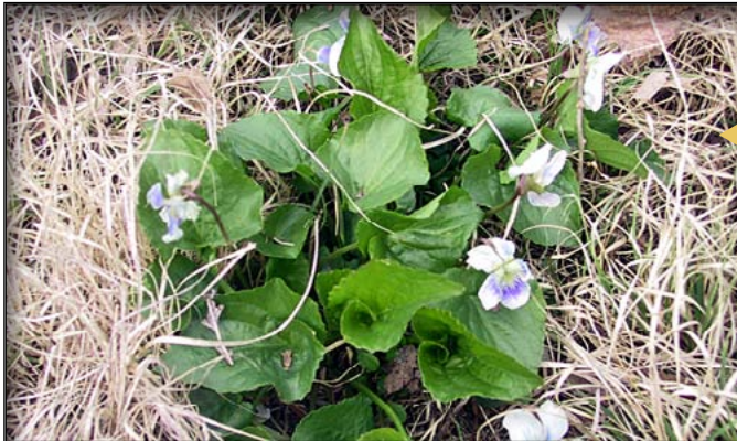
Wild violet.

This is a low-growing annual that usually is found where soil compaction exists. It is one of the first weeds to germinate in the spring, just as soon as the frost has left the surface of the soil. Close mowing will not eliminate it, but when caught early enough while the plants are still young, it is easy to control. Mid to late-summer attempts at controlling this weed, especially reducing seed production and future infestations, usually fail. To correct without chemical use, initiate a practice of core aeration and continue the practice annually, especially if the areas are going to be compacted continually from foot or vehicular traffic.