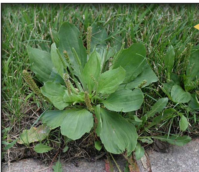
Broadleaved plantain.

It often is confused with clover and black medic in leaf form. They differ significantly when viewed side by side in that the oxalis has distinctly heart-shaped leaflets that are always a lighter or yellowish green. This is a unique weed in that it has both annual and perennial forms; the flower and capsule (fruiting structure) are what warrant special comment. The flower is yellow and tubular, and when the capsule matures, it expels the seed, doing so with great momentum, scattering the seed like birdshot in multiple directions several feet away. It is a curse to have in greenhouse environments and can go from being insignificant to a real headache if not controlled early in detection.