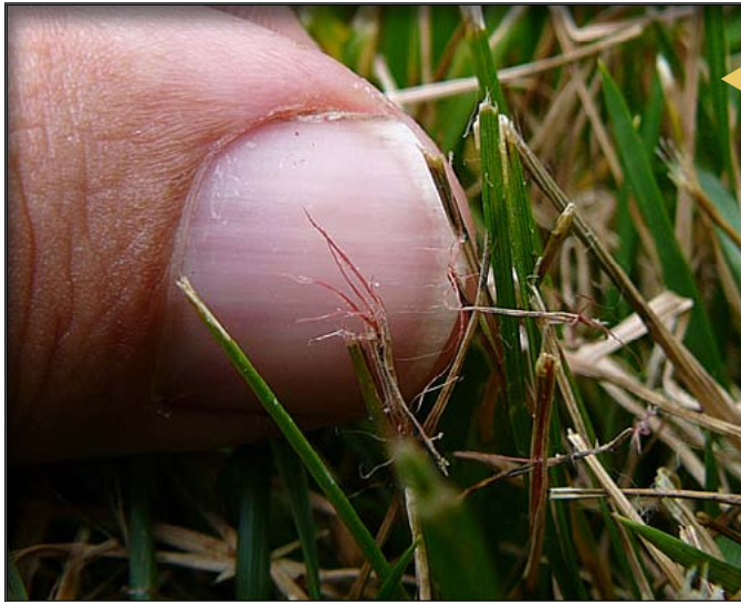
Red thread (mycelium in front of thumbnail).

New Kentucky bluegrass cultivars, some with moderate to high levels of leaf spot and melting out resistance, are released every year. Contact your county Extension office for a list of resistant cultivars. Avoid planting susceptible cultivars such as ‘Park,’ ‘South Dakota Common’ and ‘Kenblue.’