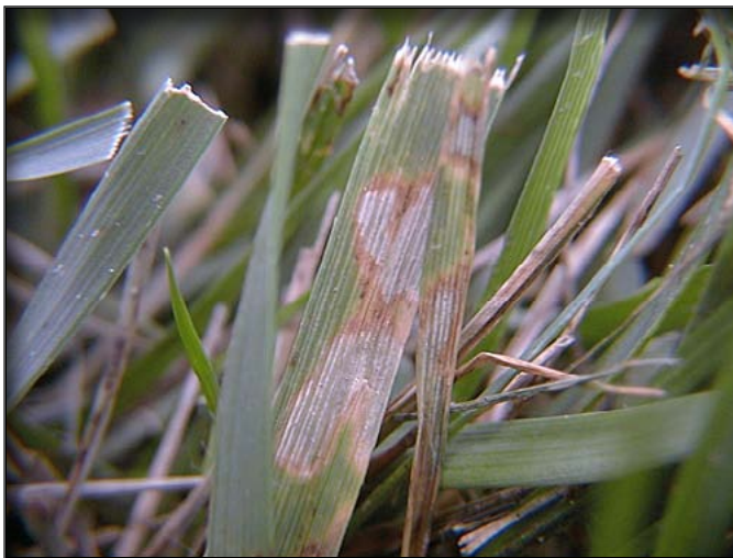
Brown patch leaf lesions.

Cultural methods to prevent brown patch: Do not over apply nitrogen fertilizer, avoid prolonged leaf wetness by providing irrigation deeply and infrequently in the morning or early afternoon, and prevent thatch buildup.