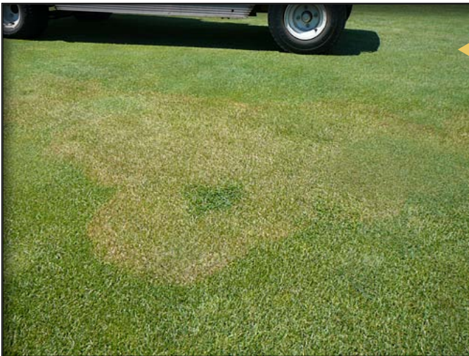
Brown patch.