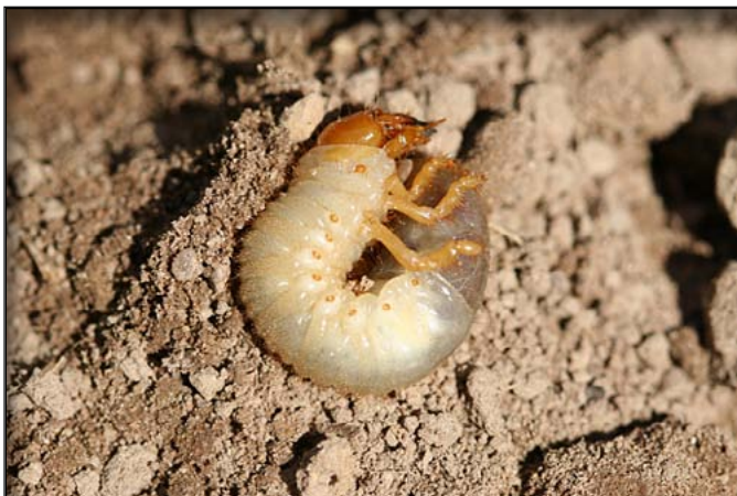
May/June beetle larvae.