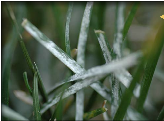
Powdery mildew.