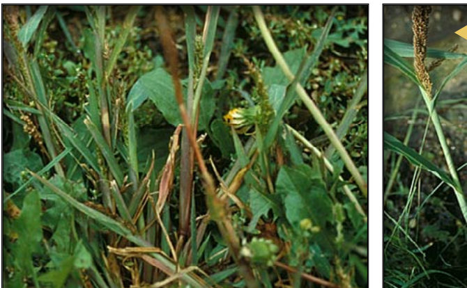
Barnyard grass with spreading base of plant, and distinctive seedheads (right). (Ron Smith, NDSU)

This bluegrass is the bane of the fussy home lawn owner. It sets conspicuous seed heads, is apple green, and will go to seed and die out when hot, dry weather arrives. It will be conspicuous in the cool, moist weeks of spring and fall. Upon close examination, the plant will have a conspicuous, membranous ligule; folded bud; and boat-shaped leaf tip.