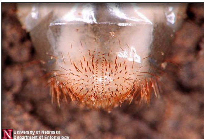
May/June beetle larvae raster pattern.