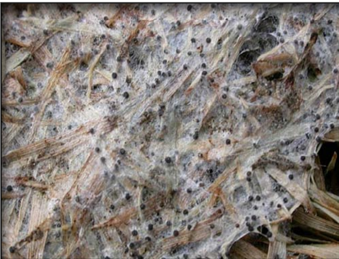
Gray snow mold sclerotia.