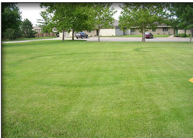
Fairy ring.

Cultural methods to prevent pythium blight: Aerate to provide soil drainage; avoid turf cultivation until infected areas have recovered; avoid excessive leaf wetness by providing irrigation in the morning; prevent thatch buildup; raise mowing height to encourage deeper rooting; avoid mowing in infected areas during moist, hot weather; prune trees to provide good air circulation to the turfgrass canopy; avoid summer stress of turfgrass; apply a slow-release nitrogen fertilizer; apply a contact fungicide for preventative control; use fungicide treated seed; and use resistant turfgrass cultivars.