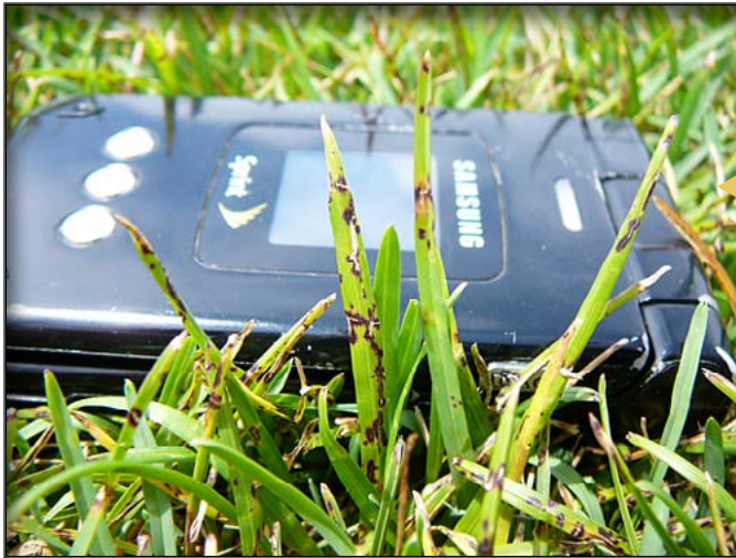
Leaf spot phase.

Cultural methods to prevent stripe smut: Avoid frequent light irrigation in the afternoon and evening. Control seldom is required because the disease is rarely severe. Apply nitrogen to infected areas, along with deep watering early in the day to stimulate growth and aid recovery.