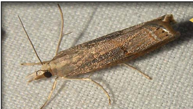
Sod webworm adult.

More than 40 species of sod webworms can be found in eastern North Dakota. The first signs of sod webworm activity are moths flying in an up-and-down pattern over the turf canopy during the twilight hours. The dull-colored moth ranges from 0.5 to 0.75 inch long, and has a snoutlike projection rather than a typical proboscis and wings that fold over the body when closed, giving it a wedge-shaped appearance.