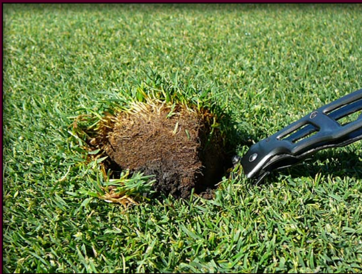
Thatch.

Most homeowners desire a beautiful lawn, and many spend hours or even a significant amount of money to achieve that goal. No matter how much effort one puts into managing a beautiful, vigorous lawn, turfgrass diseases are something that all homeowners will have to cope with at some point. No single turf species or cultivar is resistant to all grass diseases. However, planting resistant turfgrass cultivars is a wise policy and will reduce the odds of encountering a disease problem.