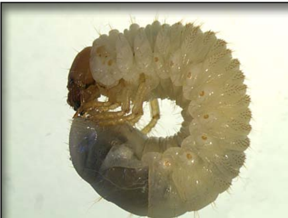
Masked chafer larva.

Threshold number: eight to nine larvae per square foot