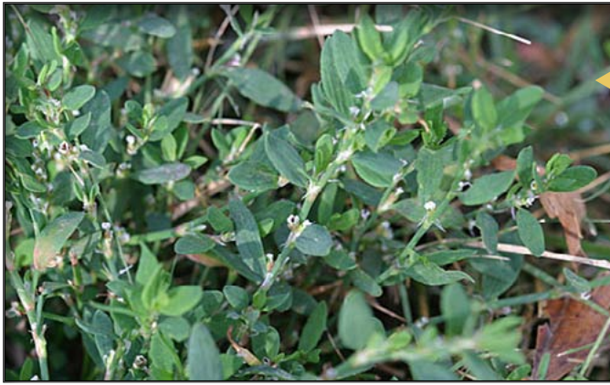
Prostrate knotweed.