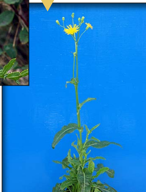
Perennial sowthistle.