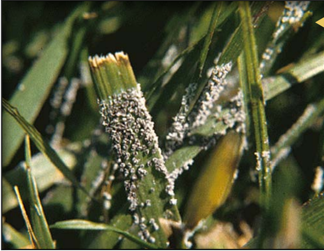
Slime mold.