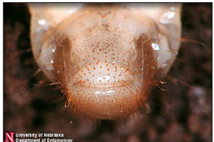
Masked chafer beetle larvae raster pattern.