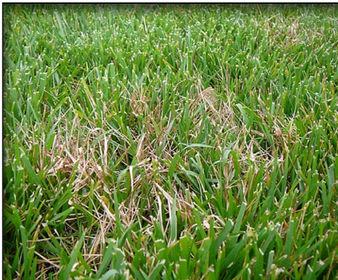
Red thread injury to turf.

Contact your county Extension office for more information regarding resistant cultivars.