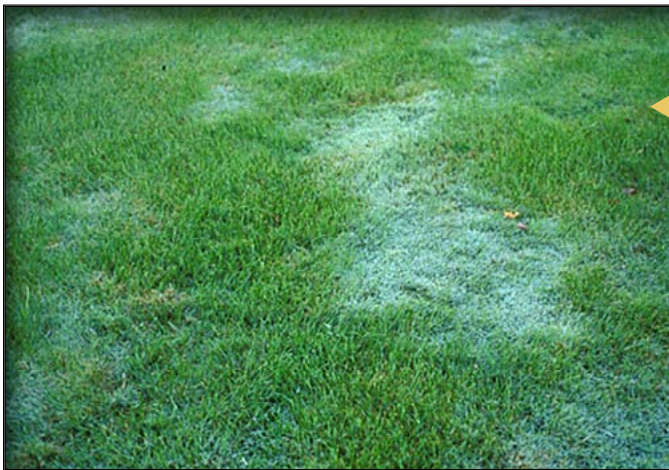
Creeping bentgrass.

Both a weed and a desirable lawn grass when planted properly and with the correct cultivar selection, tall fescue is considered a utility grass that often is used along roadsides for its tolerance to abuse. Its coarse, bunch-type habit of growth often shows up from purchasing low-quality seed mixes at a “bargain” price. It is identified by its sharp-pointed leaves, very small ligule and auricles, and stem bases that are often reddish. Although chemicals exist for selective control in lawns, the homeowner is better off either digging out the clumps with a shovel and sodding or reseeding that area. Using chemicals to control perennial grassy weeds in the lawn often leads to collateral damage that is not pleasing to the homeowner.