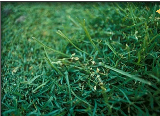
Annual bluegrass with seed heads at the edge of a golf green. (Ron Smith, NDSU)

Unlike their perennial cousins, these pests are relatively easy to control with chemicals and good management practices.