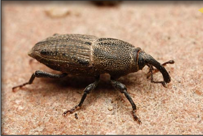
Billbug beetle adult.