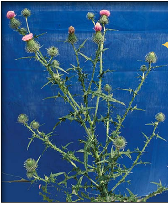
Bull thistle.