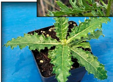
Canada thistle and Canada thistle rosette.

borne seeds. Each tiny piece of root can grow a new plant. The roots are deeply penetrating and colonizing. Multiple methods of control are employed: cutting and pulling, or spraying with glyphosate or a selective broadleaf herbicide.