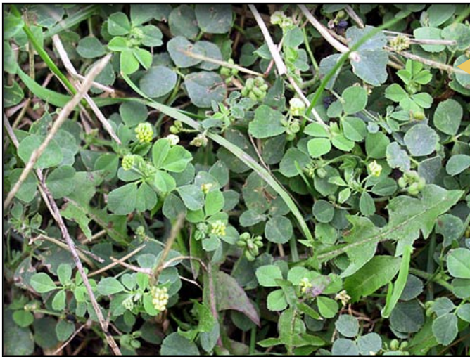
Black medic.