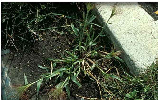
Fall panicum.

In contrast to the cool-season quackgrass that shows obvious growth in the early spring before the desirable turf has a chance to green up, crabgrass is a warm-season annual that starts to germinate at about the same time common lilacs are starting to bloom in the area. One plant potentially has 10,000 seeds, which can result in a high seedling population getting established in bare areas. This grass is easily controlled with a pre-emergence herbicide and cultural practices.