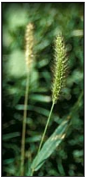
Foxtail.

Like crabgrass, this pest is most conspicuous in late summer or early fall with a display of coarse seed heads. In contrast to the crabgrass, which has a long, membranous ligule, panicum has a ligule that is a fringe of hairs.