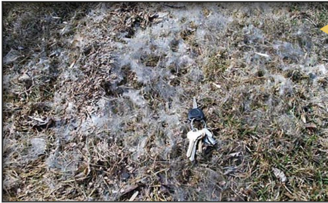
Gray snow mold mycelium. (Alan Zuk, NDSU)