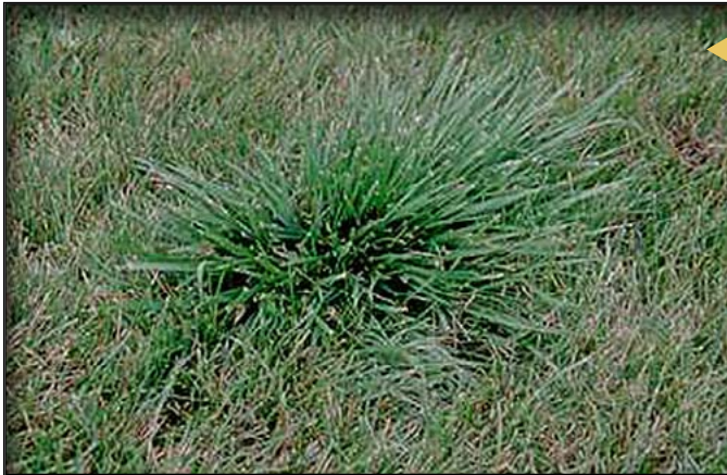
Tall fescue.

Grassy weeds pose a particular problem in lawns if they are perennials. Attempts at control can become expensive and require much effort with few satisfactory results. In many cases, the homeowner might be better off simply learning to tolerate their presence and managing the lawn to favor the full development of the desired turfgrass. Some of the more common perennial grassy weeds encountered in North Dakota lawns are: